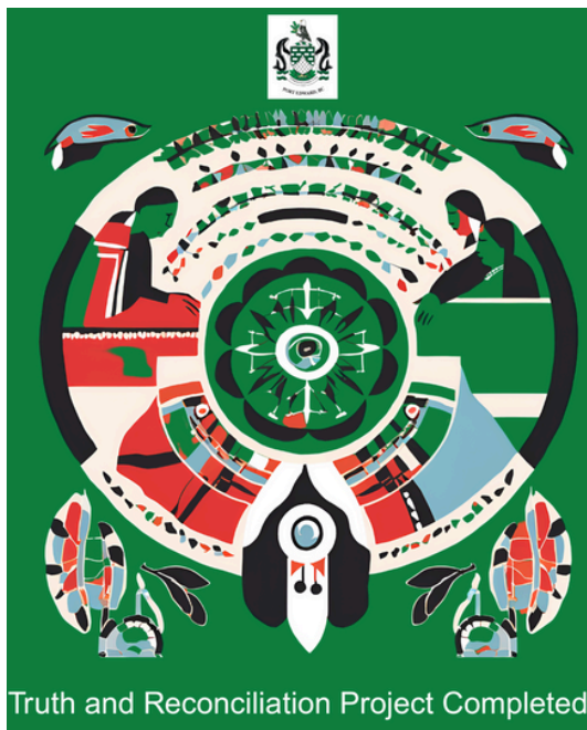
Truth and Reconciliation Project Completed