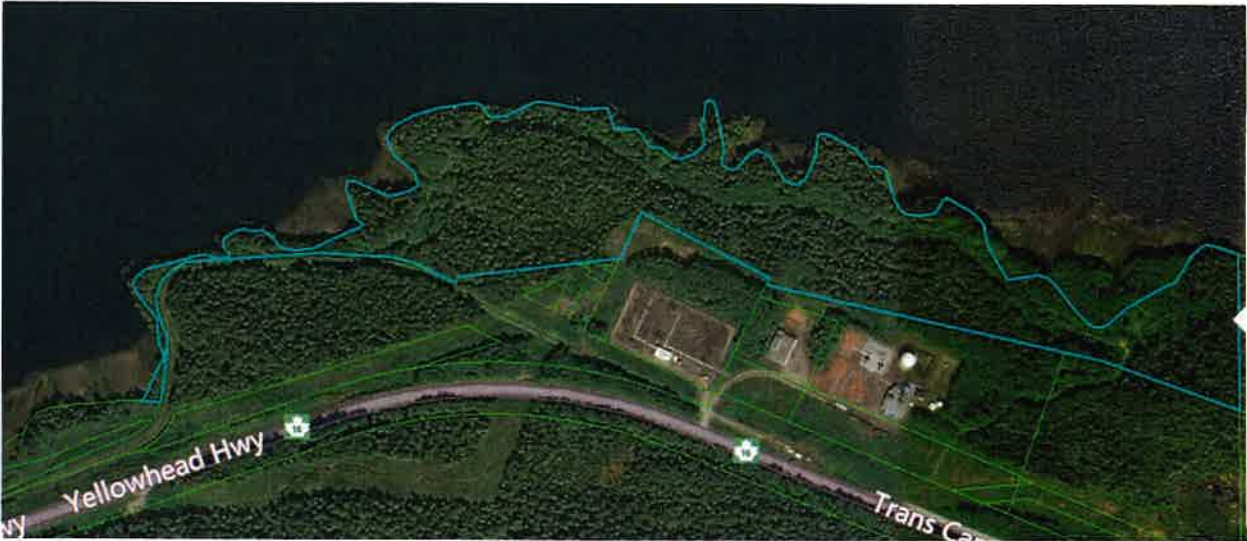
Rural (A2) to Heavy Industrial (M3)