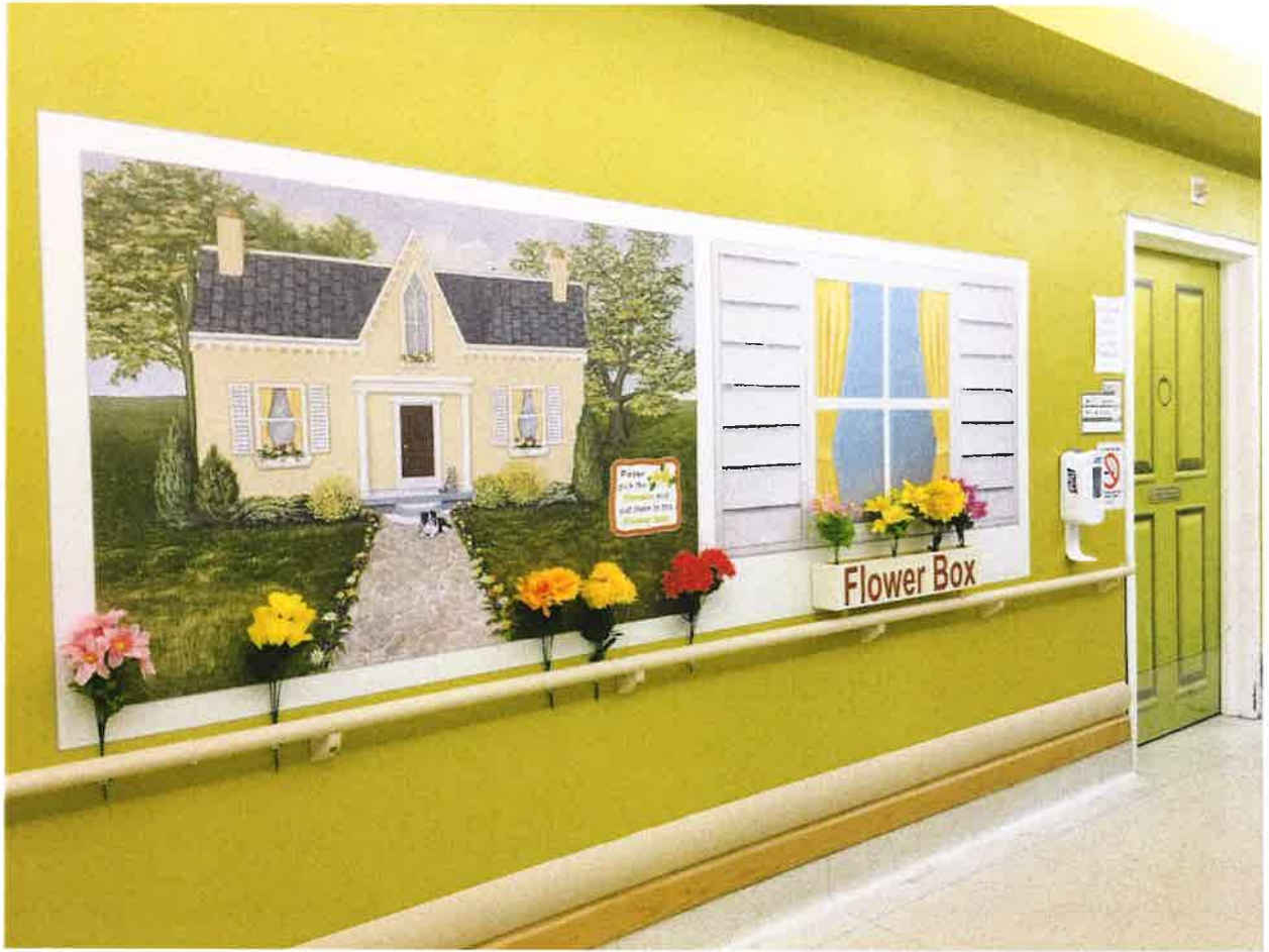
Interactive Flower Box Wrap